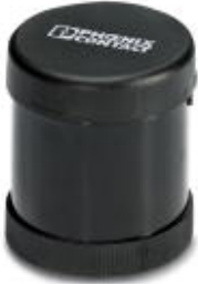
Siren element, 7 tones, 24 V DC, max. 100 dB(A), tone range over 3 signal lines, black

Please be informed that the data shown in this PDF Document is generated from our Online Catalog. Please find the complete data in the user's documentation. Our General Terms of Use for Downloads are valid ( http://phoenixcontact.com/download )